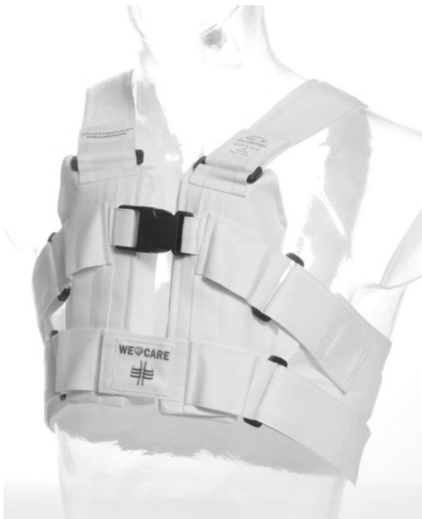
Figure 1: Posthorax® sternum support vest.

The Posthorax® sternum support vest (Epple, Inc., Vienna, Austria) is a recently developed and patented design (Fig. 1). Its outstanding