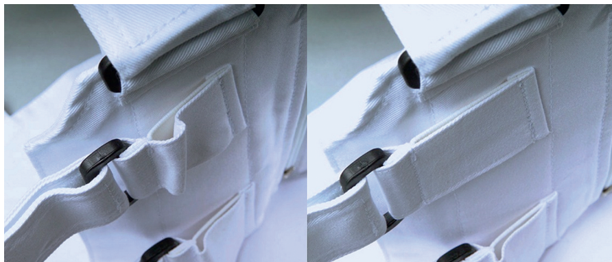
Figure 2: Shock absorbers on the lateral side of the sternum vest.

Patients were advised to wear the vest for 6 weeks postoperatively. This was controlled by a specially trained nurse. Patients who refused to wear, or did not receive the vest were monitored as well according to the protocol. According to the therapy guidelines of the American Society of Hospital Pharmacists Commission on Therapeutics, 1 g of cefazoline was administered intravenously every 8 h or every 12 h for 48–72 h, or until the chest and mediastinal drainage tubes had been removed [8]. All patients received anti-inflammatory and analgesic agents per protocol: four times 1 g metamizole intravenously per day and up to four times 7500 mg piritramide subcutaneously until postoperative day 5.